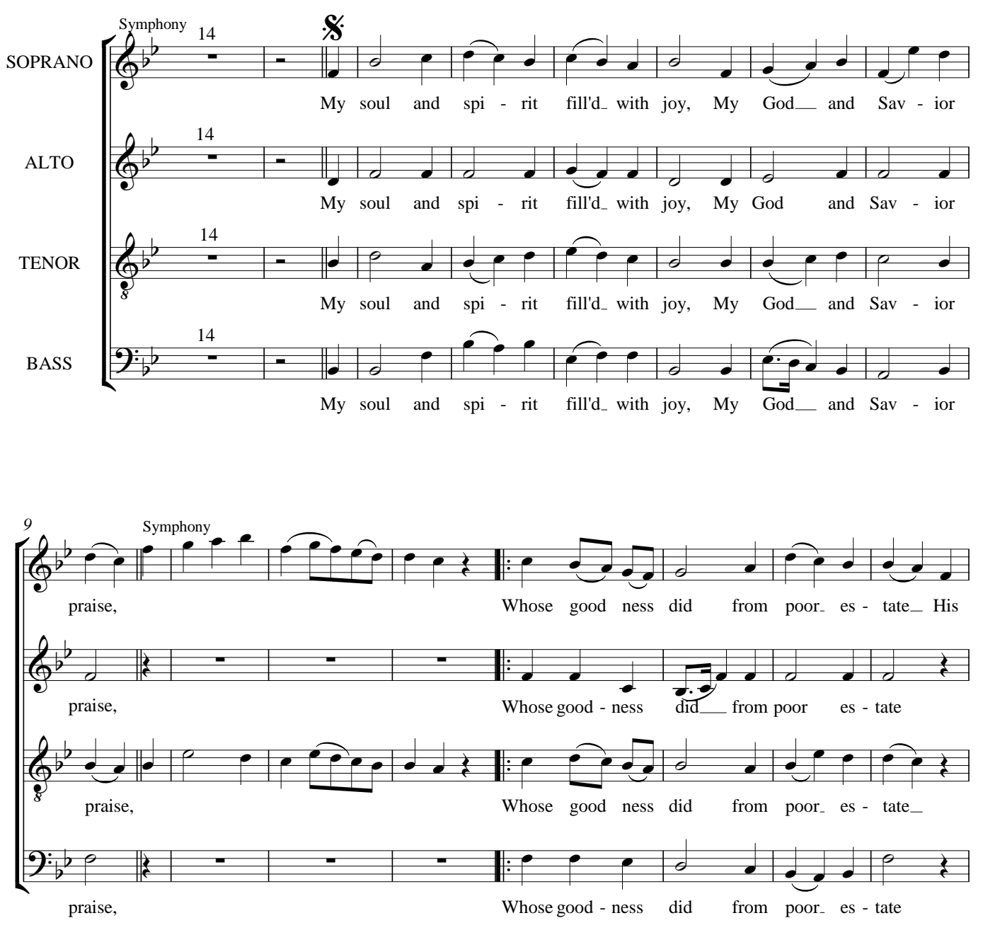
Barton-in-Fabis MS No. 118 CM